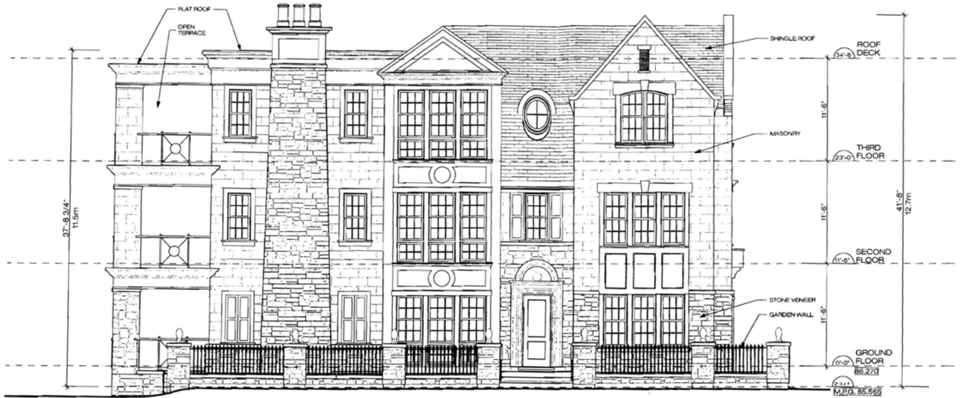
1 East Elevation SCALE: 3/16" = 1'-0"