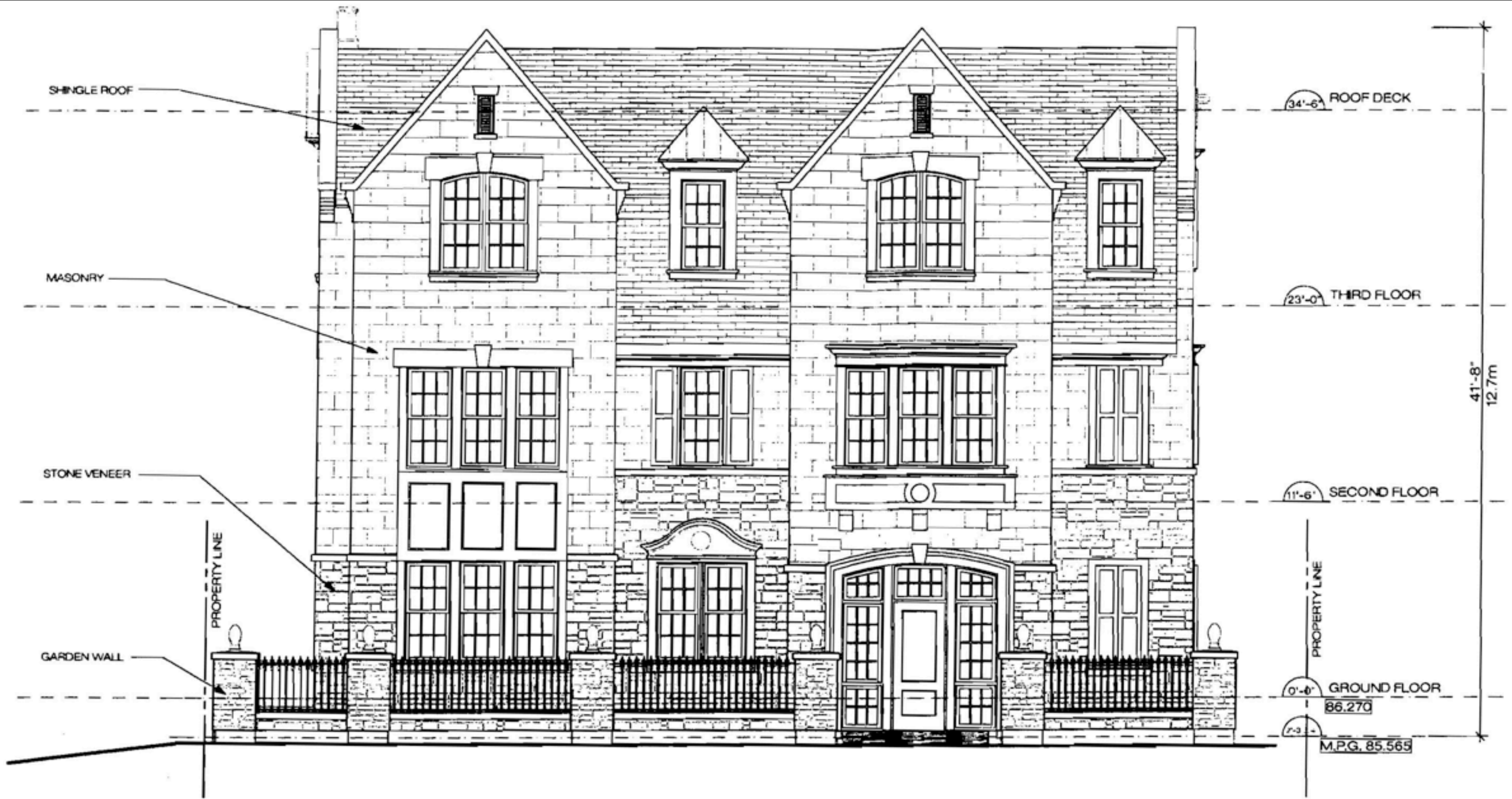
1 North Elevation SCALE: 3/16" = 1'-0"