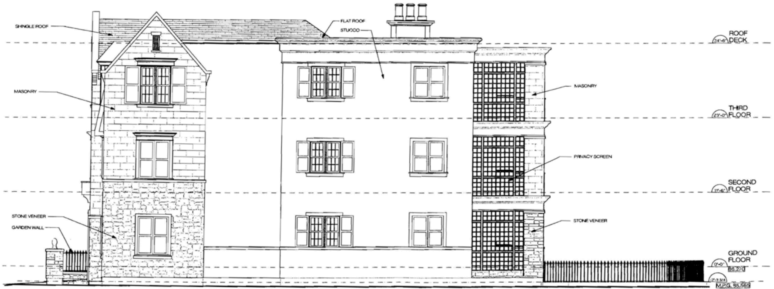
② West Elevation SCALE: 3/16" = 1'-0"